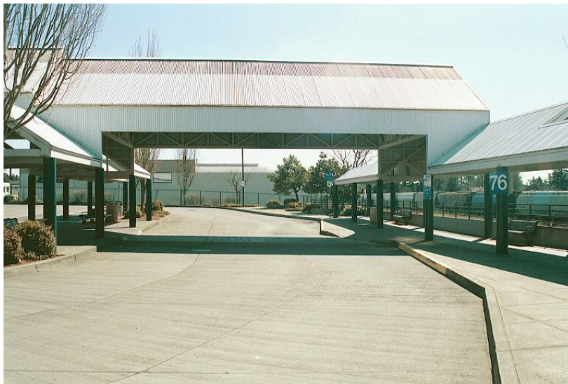
Tigard Transfer Station (TRI-MET)

The most effective and influential design approach will incorporate artistic elements at the earliest possible opportunity in the planning process.