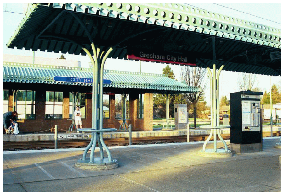
Gresham City Hall / MAX Light Rail Park-and-Ride (TRI-MET)