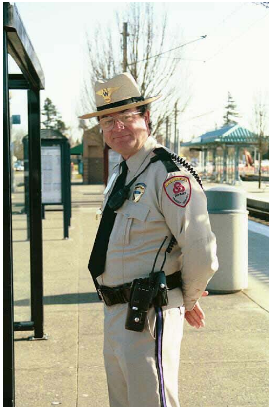
On-site security at Gresham City Hall Park-and-Ride / MAX Light Rail (TRI-MET)