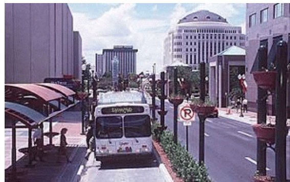
Downtown Orlando's Lymmo Shuttle System

Lymmo Orlando, Florida operates a downtown park-and-ride shuttle transit system called the “Lymmo” intended to encourage commuters to park outside the CBD and to reduce daily parking demand. The annual $1 million operating budget is financed through the downtown parking system and Orlando Community Redevelopment Agency.