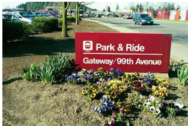
Gateway Park-and-Ride Entrance Sign (TRI-MET)